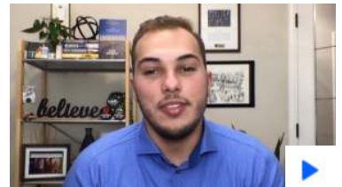
Humboldt Broncos survivor opens up about recovering after the crash