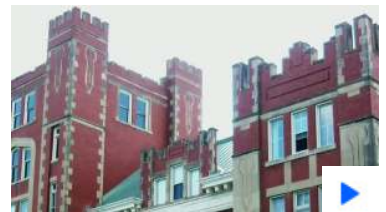
Group has plan to save school