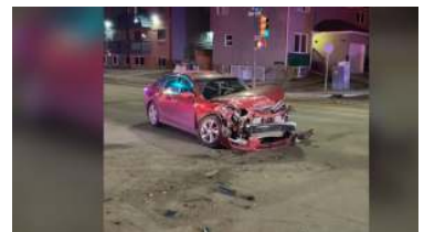
Saskatoon woman charged with impaired driving after 4-vehicle crash