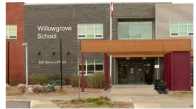
2 COVID-19 cases at Saskatoon school may be 'variants of concern'

VDQ-NRG headquarters are in Calgary. The company is about a year old and hasn’t built a plant in any city yet.