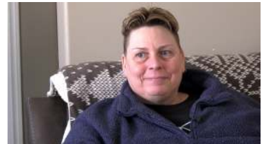
'Choose between living or dying': Sask. woman says she was forced to head to Mexico for surgery