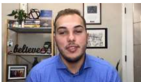
Humboldt Broncos survivor opens up about recovering