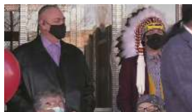
Vacant hotel reopens