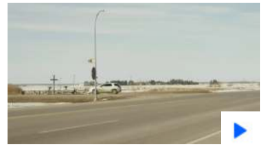
Trees removed from crash site

“We’ve utilized currently two of the cells. One was built in 2002 and 2012 and we’re reaching full capacity of that landfill so we needed to look at options of how we were going to expand and where to build our future cell,” said Miller.