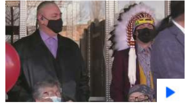
Vacant hotel reopens