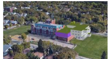
Saskatoon engineer proposes add-ons to save castle schools