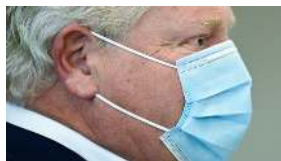
Third wave in Ontario? 'Can't let our guard down'